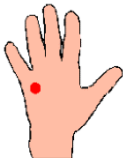
The Gamut Point